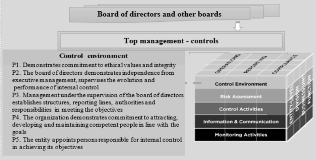
Fig. 1. Control environment elements

The entity’s control system is designed by the executive management under the supervision of the board of directors. Its assessment is conducted in strict accordance with the principles of the COSO 2013 Conceptual Framework and National Standards for Internal Control (NSIC). The control environment is part of the five necessary steps to be followed, along with risk assessment, control activities, information and communication, and monitoring of activities. The COSO integrated framework helps clarify the responsibilities of the board of directors and top management through the five control principles (P1-P5) presented in Figure 1.